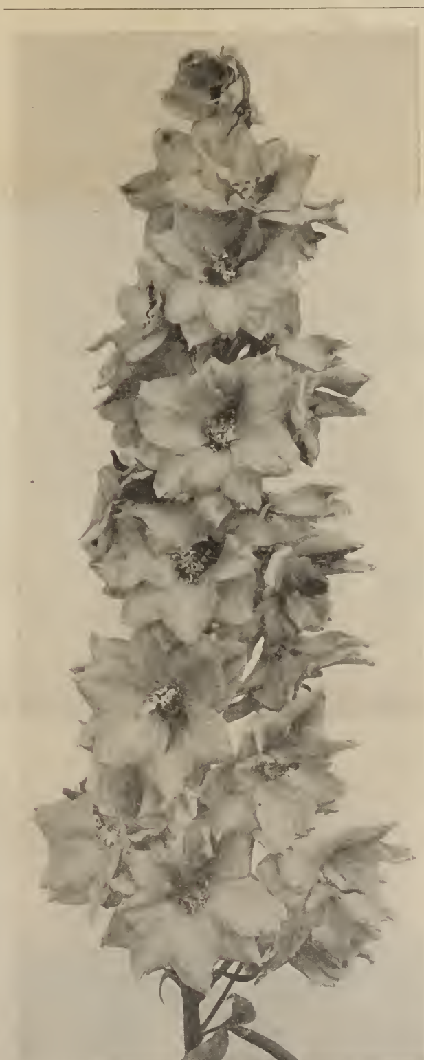
Branch Lateral of Shaw Strain Delphinium

From three-inch pots, varieties No. 249, $2.50 per dozen; $18.00 per hundred. No. 250 to No. 265, $1.50 per dozen; $11.00 per hundred. No. 266 to No. 275, $1.25 per dozen; $9.00 per hundred. Small Delphinium plants shipped express, charges C. O. D. We cannot be responsible for any green plants shipped by us by express or parcel post, as plants leave our hands and are packed in the best way possible, but due to careless handling of railway and postal employees, delays, conditions that cause plants to sweat thereby causing their loss. All green plants shipped are entirely at the purchasers risk.